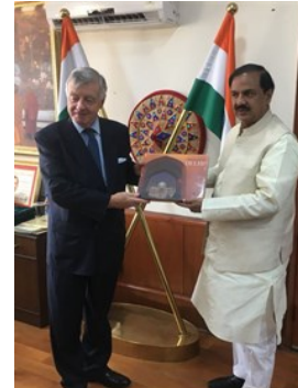
Jersey's Minister for External Relations & India's Minister of State for Environment, Forest and Climate Change

During his visit to New Delhi, Senator Bailhache was hosted by British High Commissioner to India, Sir Dominic Asquith KCMG. He met with government Ministers, senior officials and business