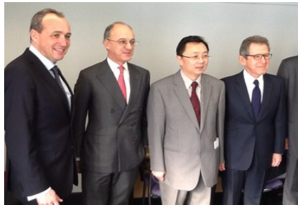
Senator Lyndon Farnham, Jersey's Minister for Economic Development at the CBBC Conference with Lord Sassoon, Ni Jian (Chinese Embassy) & Lord Browne

Along with a number of key UK political figures, Senator Ozouf also spoke at the City Week International Financial Services forum, which was attended by over 700 policy-makers, finance and business