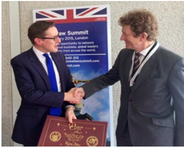
Minister of State for Justice Lord Faulks and Chief Minister Senator Ian Gorst at the Global Law Summit

Jersey's Ministers have recently been involved in a series of external engagements in the UK.